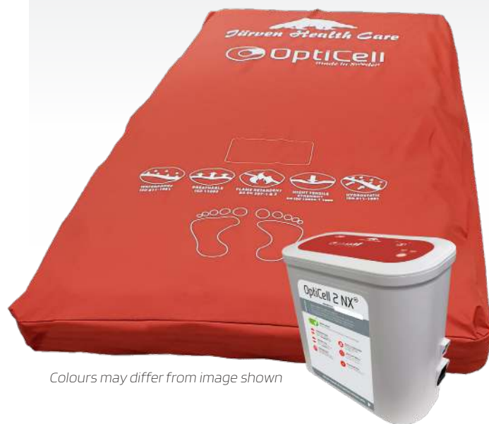
Colours may differ from image shown

* Categories defined by the International Pressure Ulcer Classification system. Guidelines produced by the European US National Pressure Ulcer Advisory Panels (EPUAP and NPUAP), together with the Pan Pacific Pressure Injury Alliance (PPPIA).