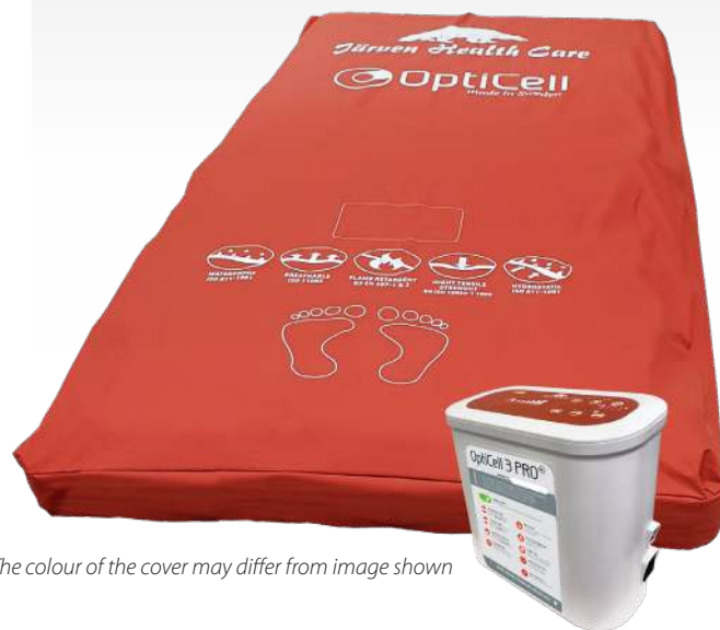
The colour of the cover may differ from image shown

* Categories defined by the International Pressure Ulcer Classification system. Guidelines produced by the European and US National Pressure Ulcer Advisory Panels (EPUAP and NPUAP), together with the Pan Pacific Pressure Injury Alliance (PPPIA).