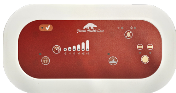
PUMP WITH INTUITIVE DESIGN

FOUR HANDLES for easy transport of the mattress.